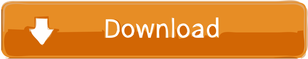
Red Giant Trapcode Suite 15.1.8 (x64) Keys